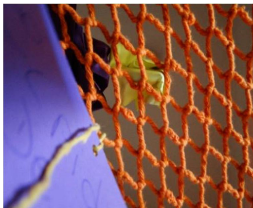
Figure 3. Installation of the nets, with the cards crushed or lashed.

The production of a blog allowed several uses in different moments of the meetings. In the beginning, it was presented as a profitable form of presentation of the participants, as workshop dynamics, means of dissemination, registration, and memory of the activities and products made, and as the valuation of subjects, virtual interaction and still transformation of concepts, visions, stereotypes, and stigmata.