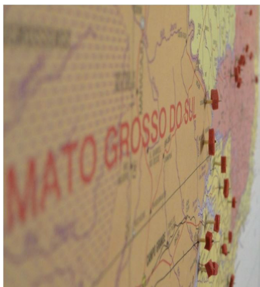
Figure 2. Map printed with pins marking a path.

Roaming is considered a mark of the street population. The meetings with our participants revealed a life of travel, of comings and goings, sometimes autonomous, others imposed, but certainly of their own knowledge. In order to represent the trajectories of the participants, a map of Brazil was used, wires and pins, and traced the paths already covered by each participant, producing the artistic installation “ Trajectories ”. The dynamics promoted interaction, identification and socialization in the group, as well as a great deal of information about the life histories of each subject. Besides identifying the cities already covered, it was possible to understand the motives, longings, relationships and difficulties lived among those who of the ‘stretch’ its own journey of life and is in transit for days or years. Therefore, trajectories are all these stories, paths, memories of territorialities, the footprints left and the steps that are yet to come, in the perspective that listening and reflecting on these experiences can resignify them.